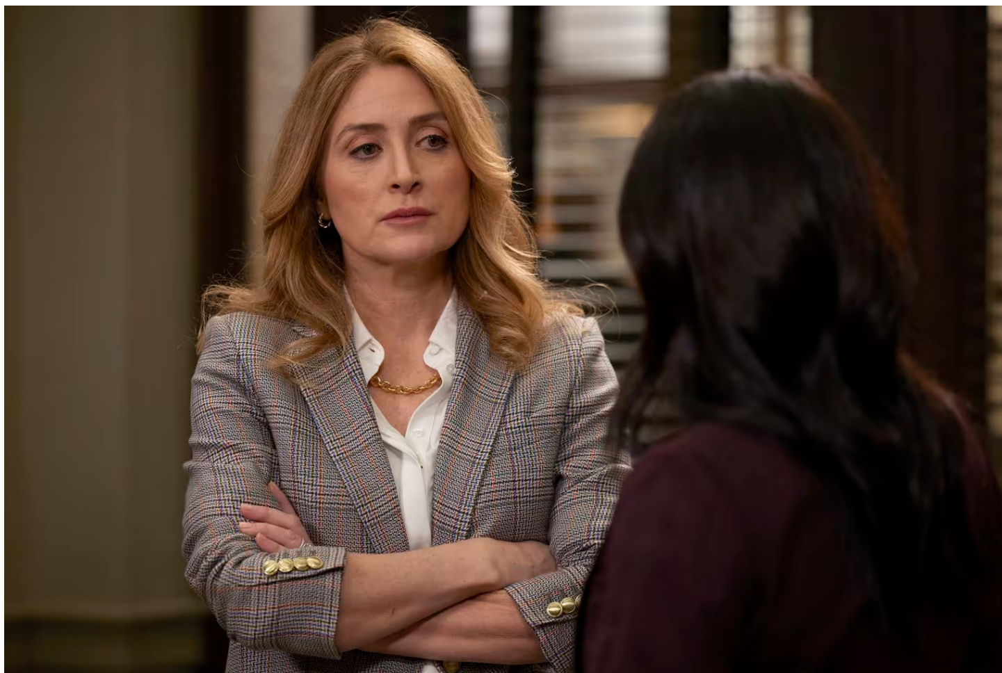
Sasha Alexander as Kristin Bartell in Season 22 of "Law & Order."

Having already been paired up with former “L&O” regular Angie Harmon on “Rizzoli & Isles,” Alexander got her turn in the mothership’s spotlight in 2023 as Kristin Bartell.