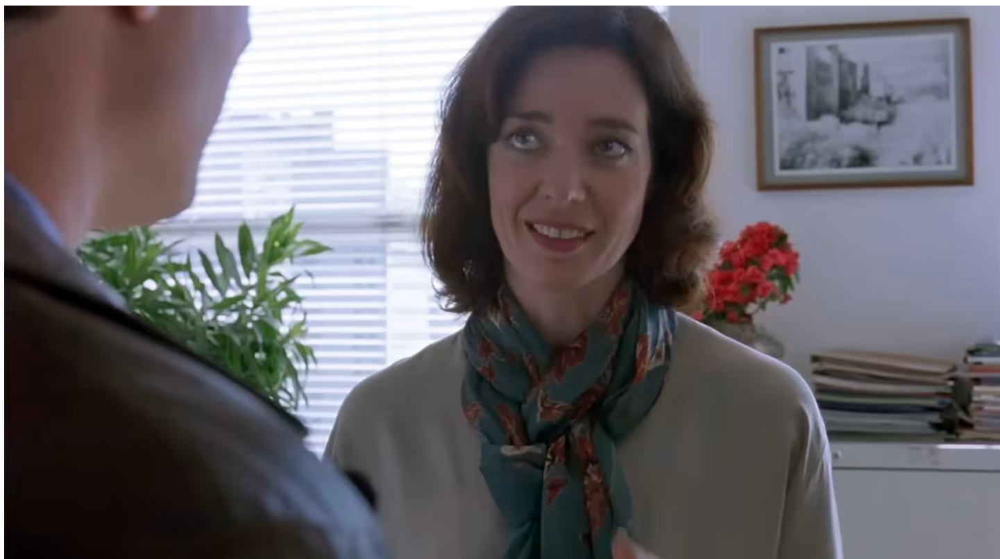
Allison Janney in the Season 4 episode "Old Friends."

She first appeared in the small role of Nora during a 1992 episode about the beating of a soap-opera actress. In 1994, she returned as Ann Madsen, a terrified witness to a horrific crime.