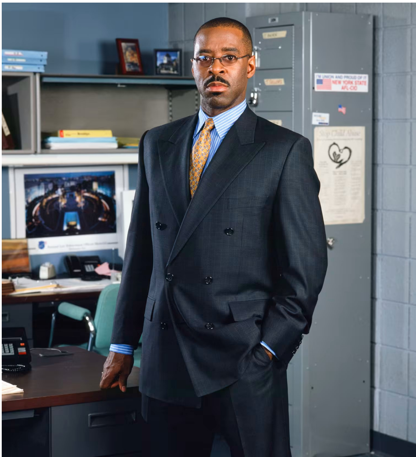
Courtney B. Vance as ADA Ron Carver on "Law & Order: Criminal Intent."

In time, two-time Emmy winner Vance (“Lovecraft Country,” “American Crime Story”) would go on to play Assistant District Attorney Ron Carver for five seasons on “Law & Order: Criminal Intent,” but he first guested on two different episodes of the