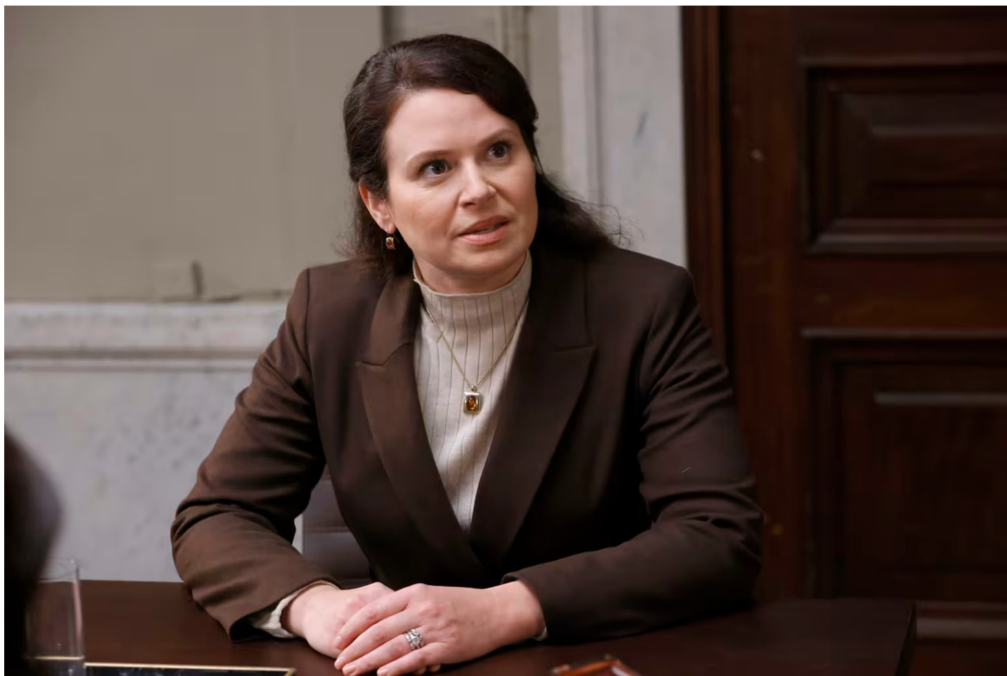
Katie Lowes as Victoria Beyer in Season 24 of "Law & Order."

Lowes, best known for her roles on “Scandal” and “The Hunting Wives,” played Victoria Beyer on the series early in 2025 as a daughter who helped her ill father go through with an assisted suicide plot.