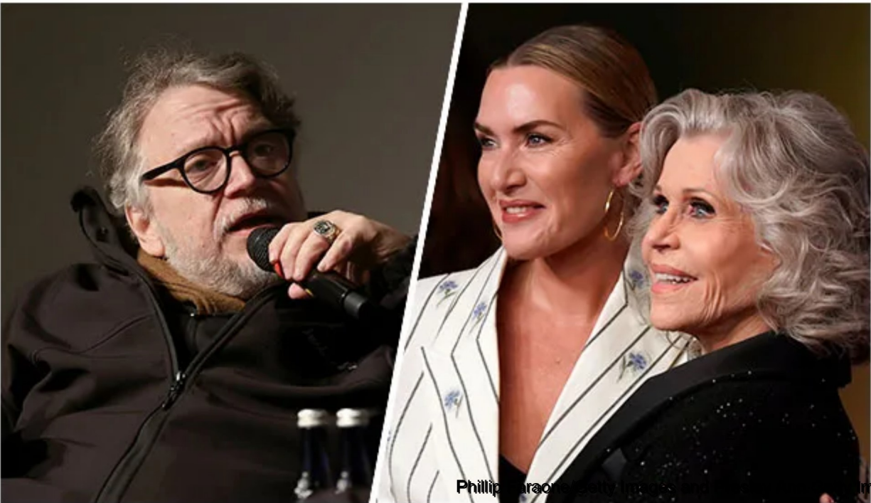
Phillip Praeger / Images

Rande Dawn • Film • January 16, 2025 12:00PM