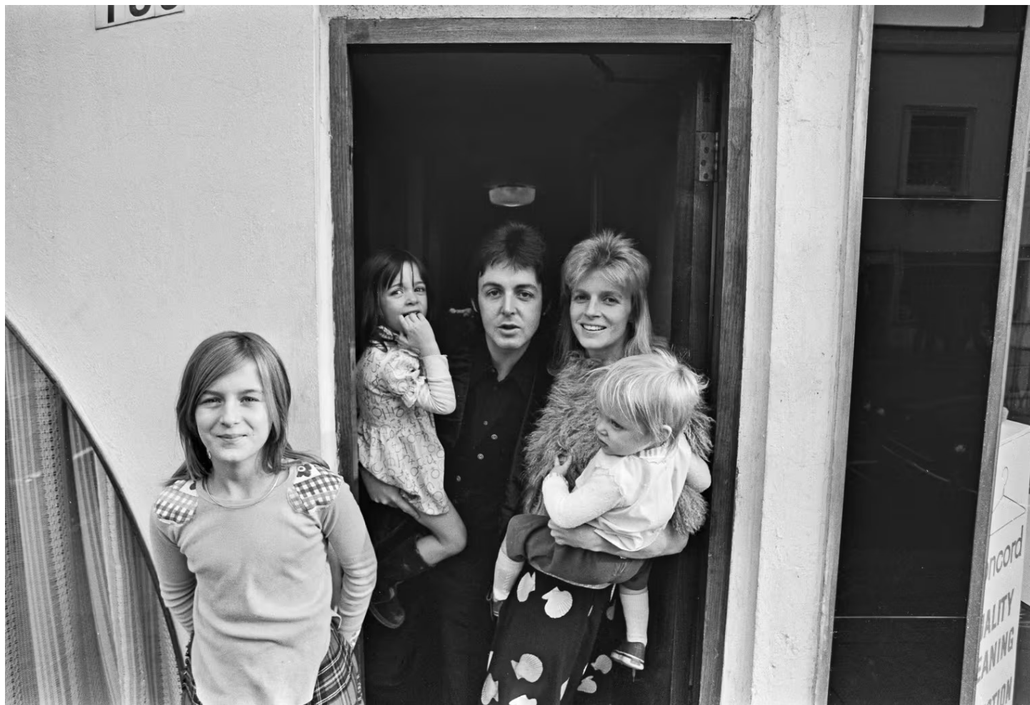
Paul and Linda McCartney with daughters (left to right) Heather, Mary and Stella in 1973.

Always the devoted dad, Paul lent his kids a hand when they needed it and supported their passions beyond his rock 'n' roll expertise, as they sought to define themselves outside of being “nepo babies” (though one of them is perfectly OK with the label).