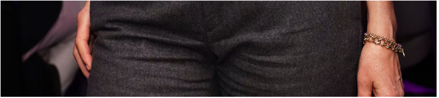
Mary McCartney in London, England, in 2023.