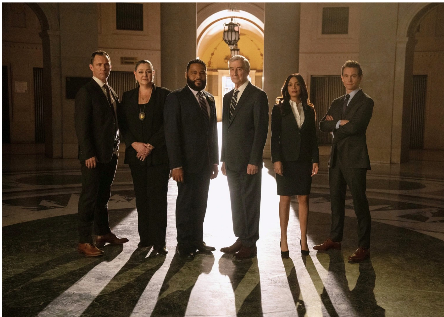
— The cast of the returned "Law & Order."

"It holds up a mirror to what's going on in society, and in that sense it's timeless," he continues. "We're always looking at each episode as a cultural conversation with differing points of view."