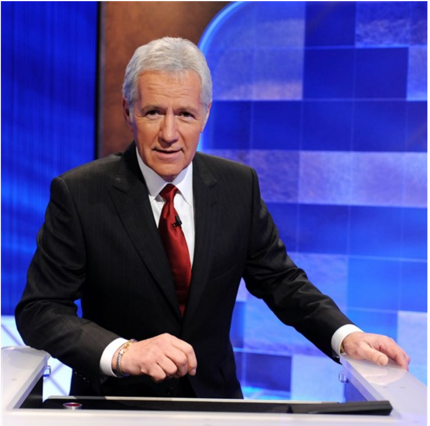
Alex Trebek on the "Jeopardy!" set in 2010.